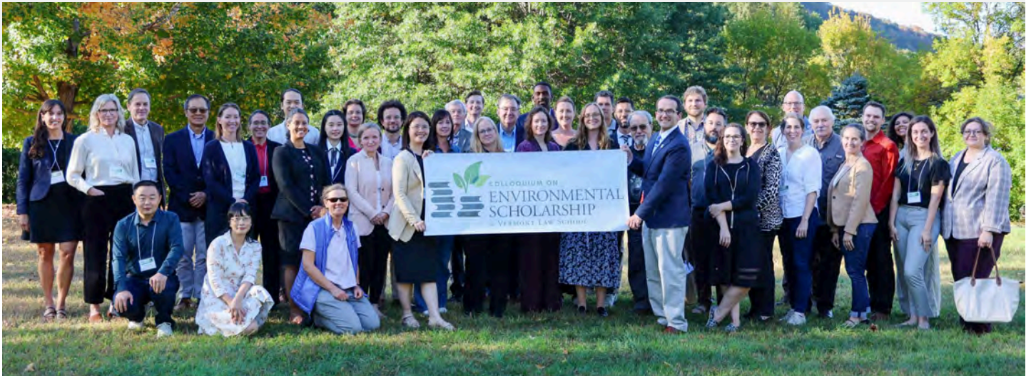
The 16th annual colloquium welcomed over 30 panelists and more than 60 attendees.

Since 2009, Vermont Law and Graduate School has hosted its annual Colloquium on Environmental Scholarship. This event offers environmental law scholars from around the world the opportunity to present their works-in-progress, get feedback from their colleagues, and meet and interact with those who are also teaching and researching in areas related to environmental and natural resources law, or any related specialty areas.