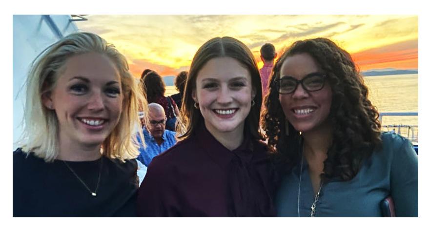
ONLINE HYBRID JD STUDENTS ENJOYING A SUNSET BOAT RIDE ON LAKE CHAMPLAIN IN BURLINGTON, VT., DURING THE 2022 FALL RESIDENTIAL SESSION

For details about Virtual Admitted Student Day, deposits, and more, visit: vermontlaw.edu/resources/for-recently-admitted-online-hybrid-jd-students. For exact deposit deadlines, please see your offer letter.