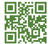
TELUS Health Student Support