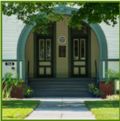
Debevoise Hall OSAD Offices | Second Floor