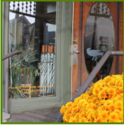
Barrister's Book Shop & Café at 190 Chelsea Street