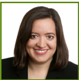
Table of Former Immigration Judges and has been a speaker and/or moderator on many CLE panels for the NJSBA/NJICLE over the years, as well as for AILA national, regional, and local conferences, NYSBA, the Federal Bar Association, the American Bar Association, and many others.